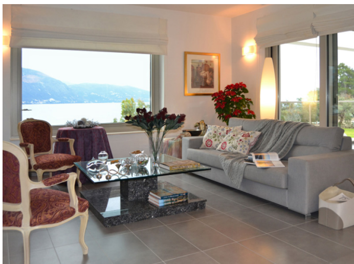
Living Room 2