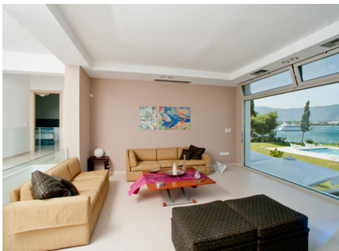
Living Room 1